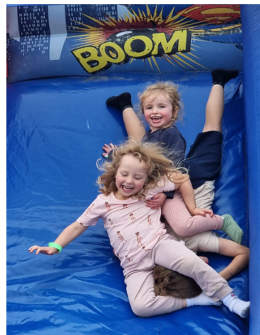
Fun on the event-day slide

To request a 2026 calendar, please telephone on 07957 992192 or email us with your requirements to 'calendars@warleyca.org.uk'. The cost is £5 plus a suggested minimum £1 donation towards the Christmas Tree appeal. We can also supply a calendar-sized posting envelope for 50p, if required.